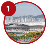
1 World Cup Stadium