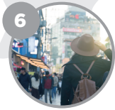
6 Hongdae Street