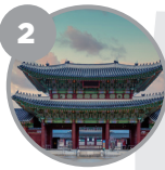
2 The Royal Palace