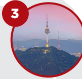
3 Namsan Tower