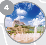
4 City Hall