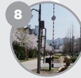
8 Gyeongui Forest Park