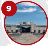
9 War Memorial Complex